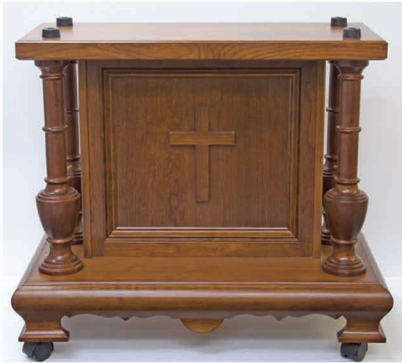
First Piece - Bier Base