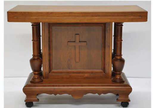
Both Pieces Together Bier Base with Flat Top