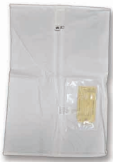
Premie Size - 7ml 18" Length x 12" Width