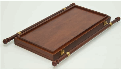
First Piece - Altar Top