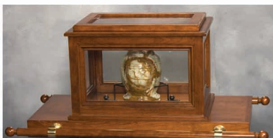
First Piece - Processional Urn Carrier