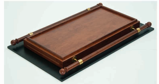
Both Pieces Together Altar Top with Black Platform