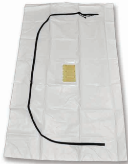
Youth Size - 8ml 60" Length x 36" Width