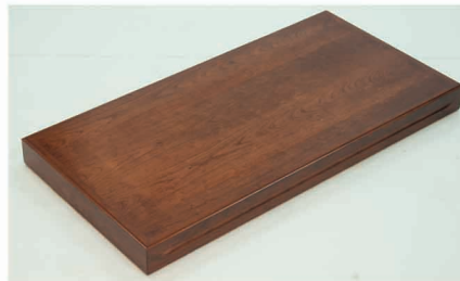
Second Piece - Flat Top