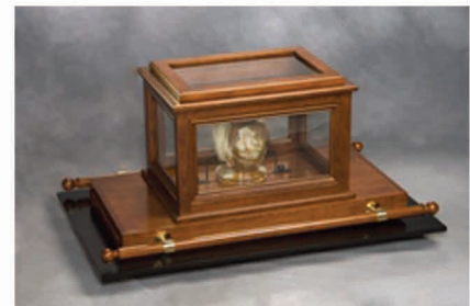
Both Pieces Together Processional Urn Carrier with Black Platform