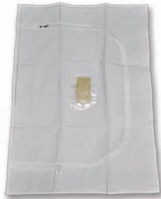
Infant Size - 7ml 30" Length x 22" Width