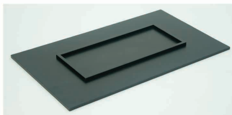
Second Piece - Black Platform